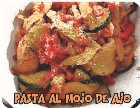
PASTA AL MOJO DE AJO